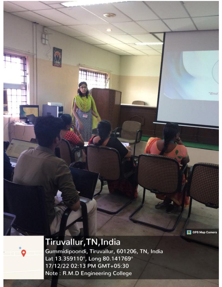
Tiruvallur, TN, India Gummidipoondi, Tiruvallur, 601206, TN, India Lat 13.359110°, Long 80.141769° 17/12/22 02:13 PM GMT+05:30 Note : R.M.D Engineering College